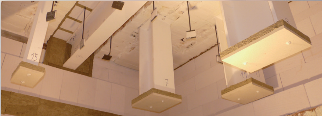
BEFORE THE TEST