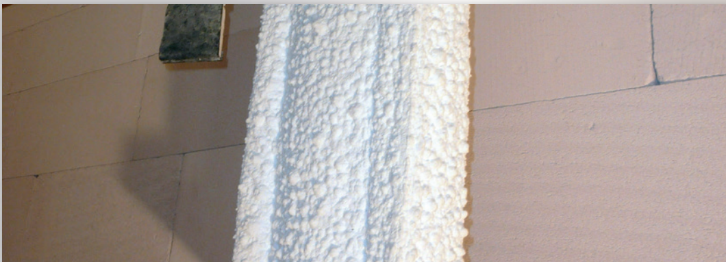
AFTER THE TEST